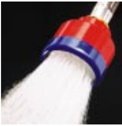
"Red Head" Water Breaker Head