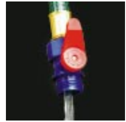
3/4" Shut Off Valve- Fingertip