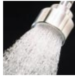
Aluminum Water Breaker Head