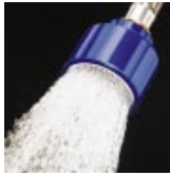
Blue Water Breaker Head